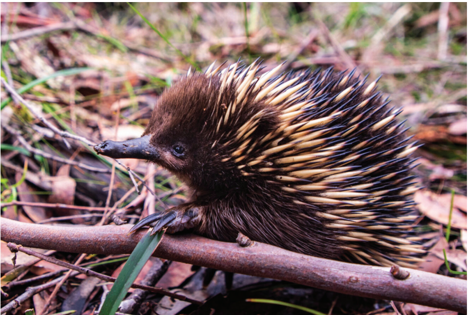
2023 entrant's image