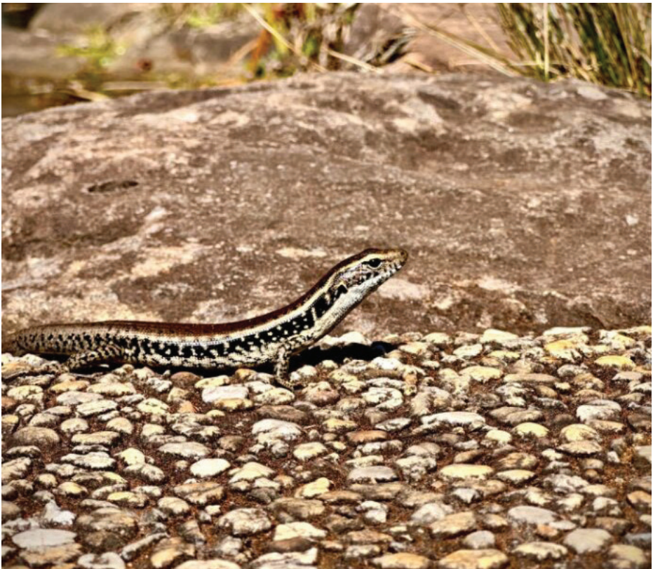
2023 entrant's image

Please note: Online entries are limited to three photos per entrant.