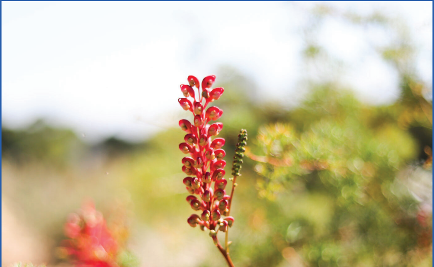
2023 entrant's image

Students should also enter their School's information to ensure their entry is included in the School's tally.