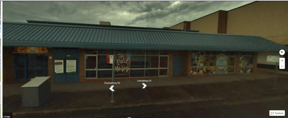
Children to depart/arrive via back entrance and group to walk through alley way to front of cinemas