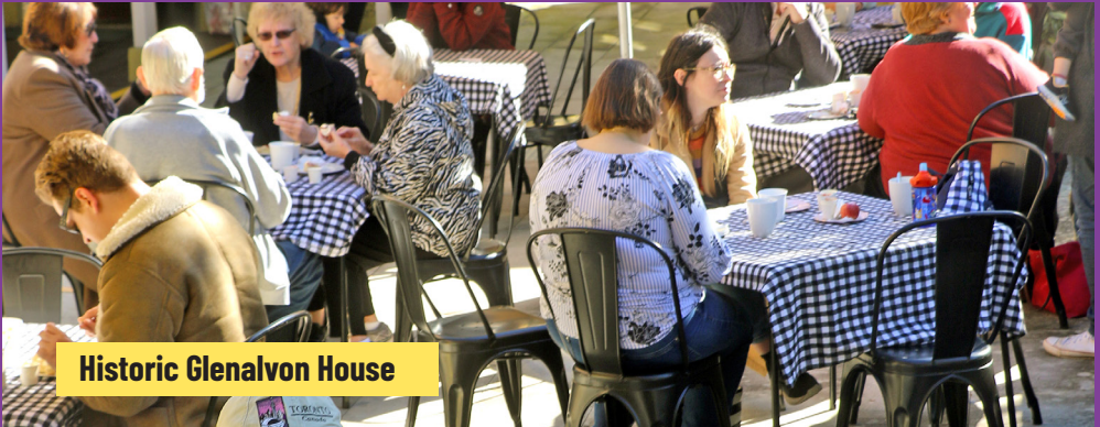
Historic Glenalvon House

Our partnership with Campbelltown and Airds Historical Society offers an attractive incentive for marketgoers. Historic Glenalvon House is open for tours twice a month and is conveniently located within the market area on Lithgow Street. Attendees can also enjoy a bi-monthly Devonshire tea in the courtyard.