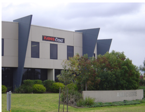
Figure 7.2.1 An examples of well articulated industrial buildings.