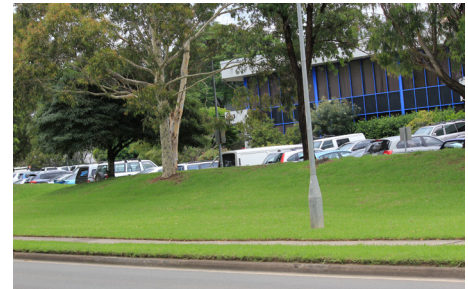
Figure 7.3.1 Examples of landscaping incorporated into car parking within industrial areas.