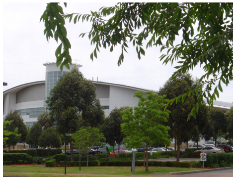
Figure 7.4.1 - An Example of well landscaped industrial development.