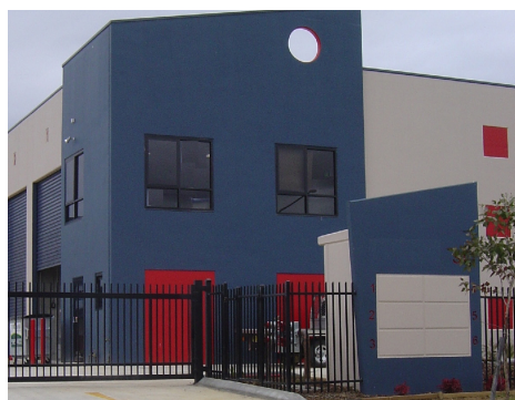
Figure 7.3.4 An example of the use of a palisade fence in an industrial development.