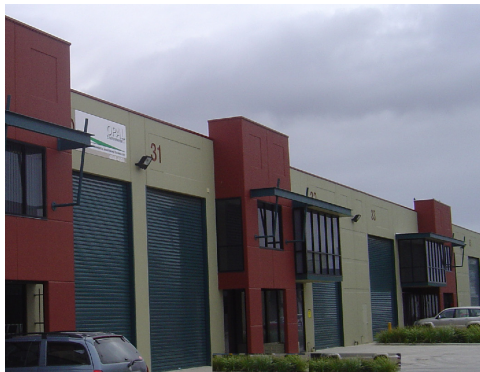
Figure 7.9.1 - An example of a multi-unit complex with individual loading/parking for each unit.