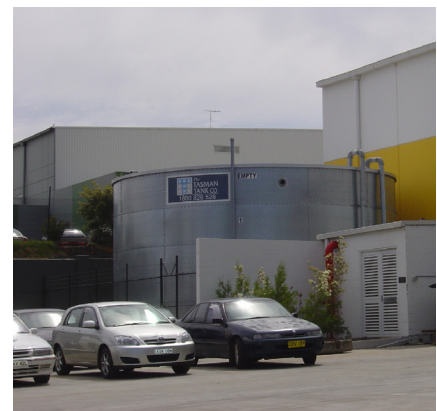
Figure 7.7.1 - An example of liquid storage tank.