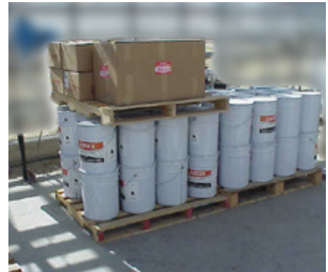
Figure 7.5.1 - An example of unacceptable solution for outdoor liquid storage area