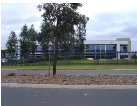
Figure 7.3.2 Examples of loading bays provided for individual units and separate from car parking and landscaped areas.