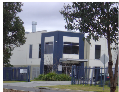
Figure 7.2.2 Examples of easily identifiable entry.