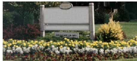
Figure 8.7.1 - Examples of acceptable signs for Centre-based Child Care Facilities.