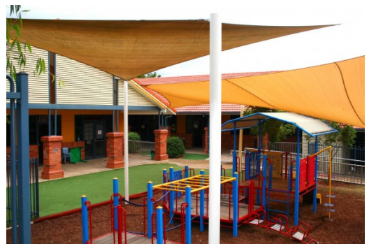
Figure 8.6.1- Example of a well designed, shaded outdoor play area.