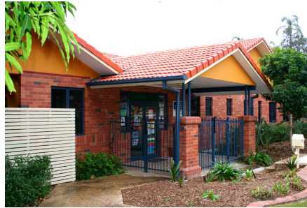
Figure 8.3.2 - An example of a Centre-based Child Care Facility located within a residential area that is of appropriate scale and character.