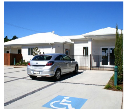
Figure 8.4.1 - Stacked configuration of car parking spaces as shown in this photos will not be included in the parking calculations.