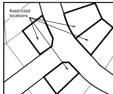
Figure 8.3.1 - An illustration of lots that may present potential vehicular/pedestrian safety hazard.