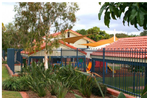
Figure 8.5.2 - Landscaping used for shading and screening.