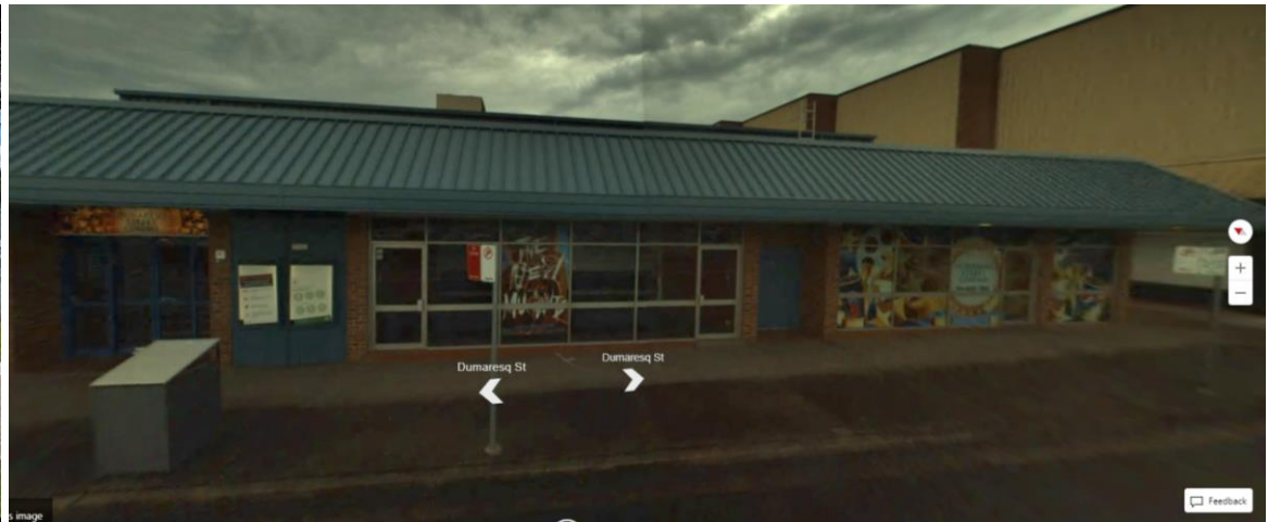
Children to depart/arrive via back entrance and group to walk through alley way to front of cinemas